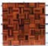
Florlok: 3' x 3' Sections Sizes up to 30' x 30'