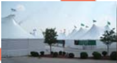
VISUAL APPEAL ENGINEERED TO WITHSTAND HARSH WEATHER CONDITIONS

A great tent that provides for both shelter from weather conditions as well as a pleasing look is the tension tent. Anchor Industries® is the manufacturer of the Century® line of tension tents, which is the majority of what JK Rentals carries in inventory. This style of tent is perfect for just about any event, from a small backyard wedding to a larger corporate event. Another reason most customers opt for a Century® tent rather than a traditional pole tent, other than its impressive visual appeal, is the fact they are engineered to withstand harsher weather conditions. As a matter of fact, with JK Rentals professional installation, these canopies can withstand winds in excess of 70 miles/hour. Our extensive inventory includes Century® tents in profiles 30, 40, 60, and 80 feet in width and over 500 feet in length for each profile.