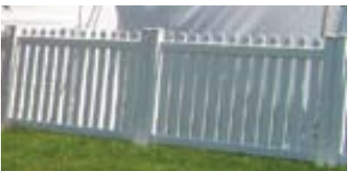
6' PVC Sections