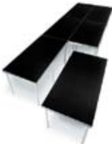
Wenger: 4' x 8' Sections Heights: 8", 16", 24", 32", 40", 48" (48" requires additional bracing)