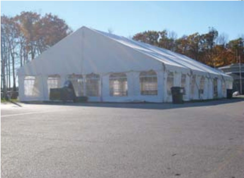
STABILITY AND SIMPLICITY, MORE USABLE SQUARE FOOTAGE

The use of traditional canopies, such as pole and frame tents, has been a mainstay in the rental industry since its basic inception. However, with the increasing popularity of large profile structures, there needed to be something to bridge the gap between smaller frame tents and these fabric structures. Anchor Industries® engineered and produced what is known as the Navi-Trac® frame tent. This frame system combines the stability of a Clear Span structure with the simplicity of a traditional frame tent. Also, the use of a gable end allows for more usable square footage for things such as projection screens and stages that can go tight to the end of the tent. JK Rentals carries this style tent in both 40 foot and 50 foot widths and to nearly any length in 20 foot increments.