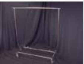
30 Hangers Provided with Rental