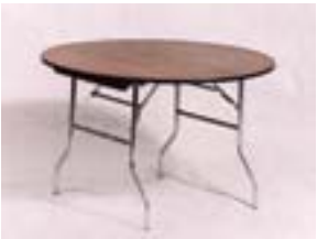
Round: 48", 60"