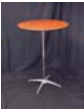
Cocktail: 30" (height: 30" or 42")