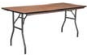
Banquet: 4', 6', 8'