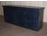
Colors: Blue and White